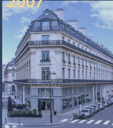
Launched Meridia I (Hospitality)