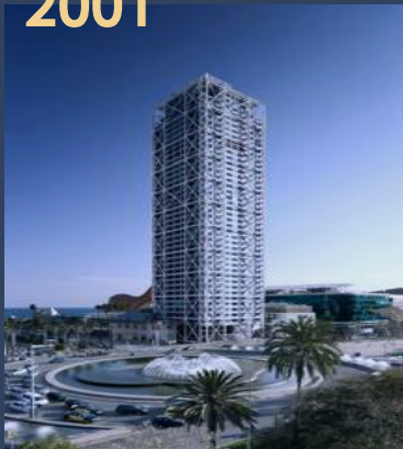
Acquired Hotel Arts