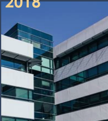
Agreement Franklin Templeton SIF