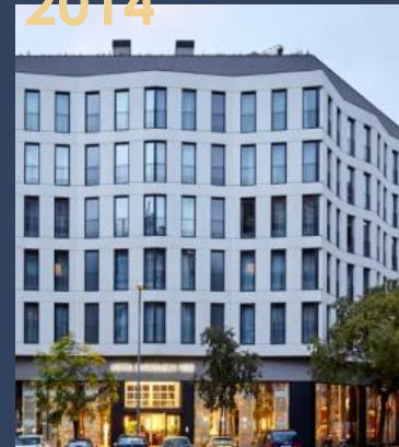
Launched Meridia II (RE) Exited Meridia I (Hospitality)