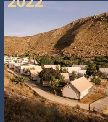
Launched Meridia Glamping Program