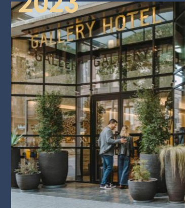
Launched Meridia V (RE)