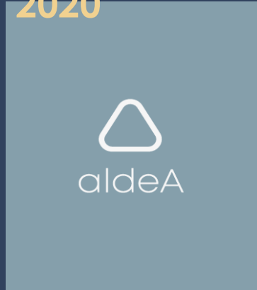
Agreement with Aldea Ventures to launch Aldea Tech Fund (VC)