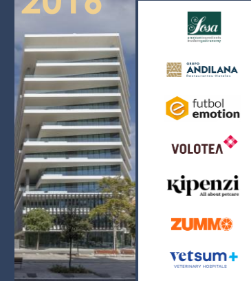
Launched Meridia III (RE) Launched Meridia PE I